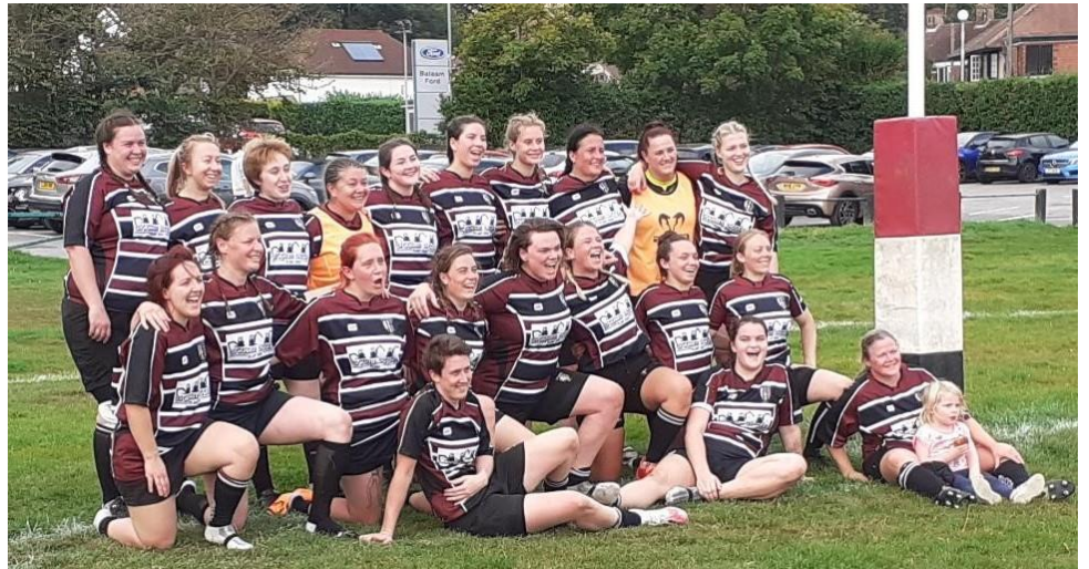
Ladies 1 st XV after a glorious win over Blackheath With their new shirts, courtesy of Wickham Diggers.

It is always sad to see great clubs like these struggling and it should serve us a warning to us all. We are doing well at the moment thanks to all our members but let us not get complacent. Keep supporting your club.