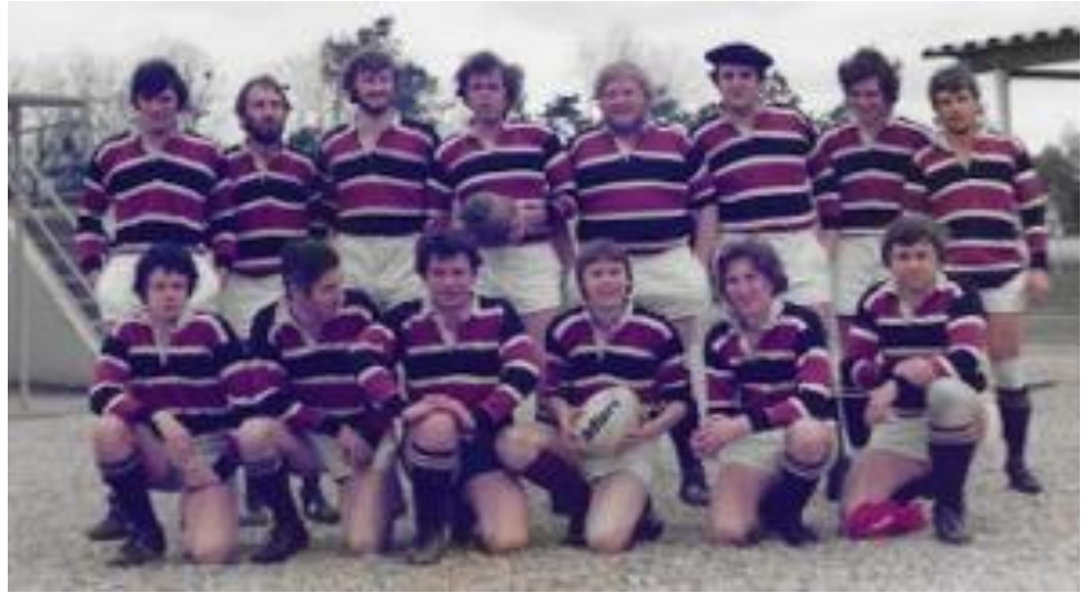
Beccs prepare to take on the French – Bordeaux 1979